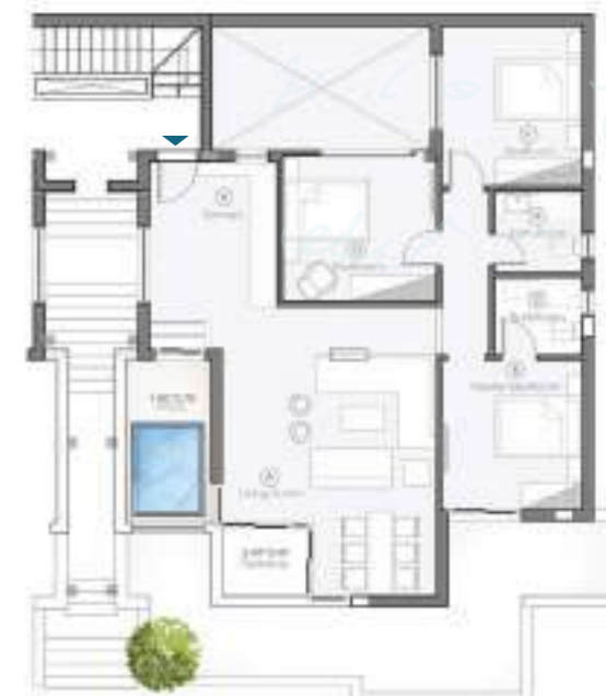
RIVIERA CHALET SECOND FLOOR