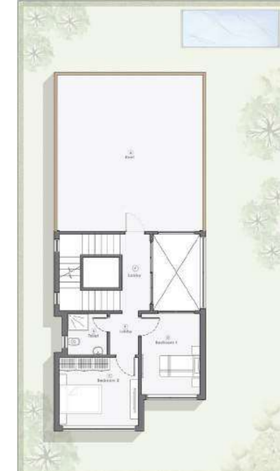
MINI STAND ALONE SECOND FLOOR