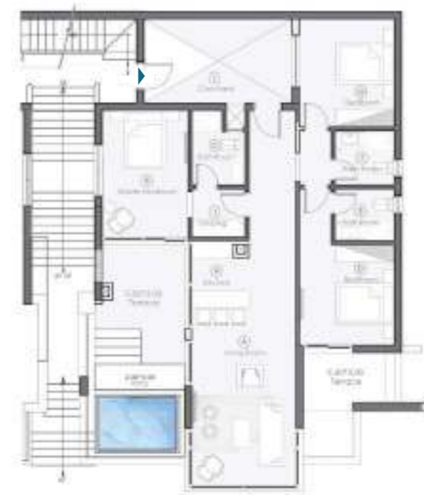
GRIMALDI CHALET FIRST FLOOR