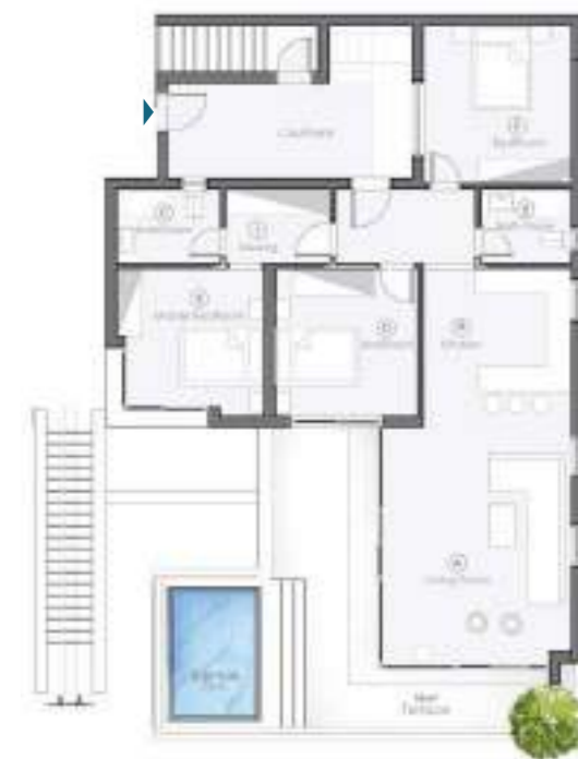
RAINIER CHALET SECOND FLOOR