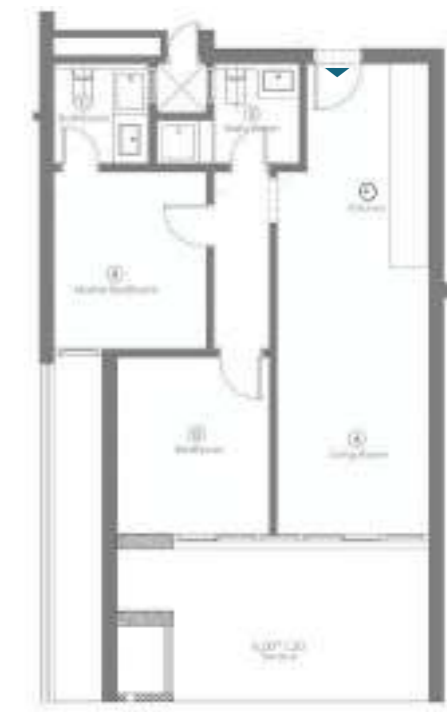
POOL LODGES TYPICAL FLOOR