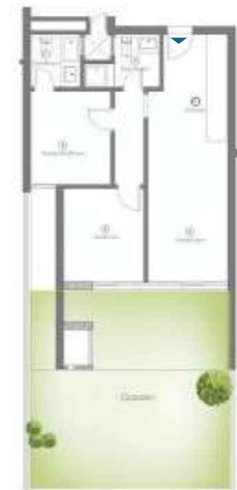
POOL LODGES GROUND FLOOR