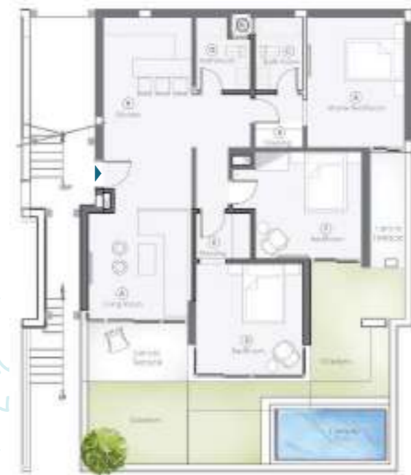
GRIMALDI CHALET GROUND FLOOR