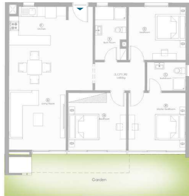
DOUBLE C- 3 BEDROOMS GROUND FLOOR