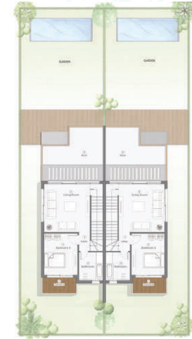
TWIN HOUSE SECOND FLOOR