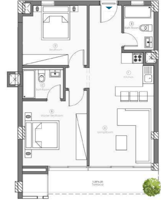
DOUBLE C - 2 BEDROOMS TYPICAL FLOOR