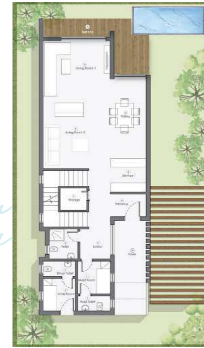
MINI STAND ALONE GROUND FLOOR