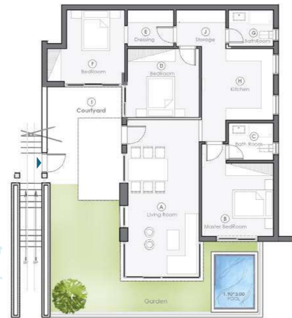
RAINIER CHALET GROUND FLOOR