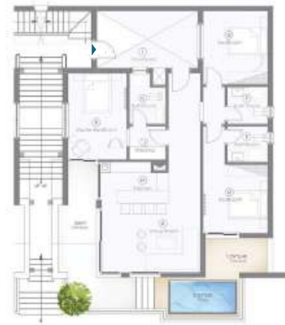
RIVIERA CHALET FIRST FLOOR