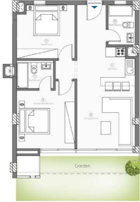
DOUBLE C - 2 BEDROOMS GROUND FLOOR