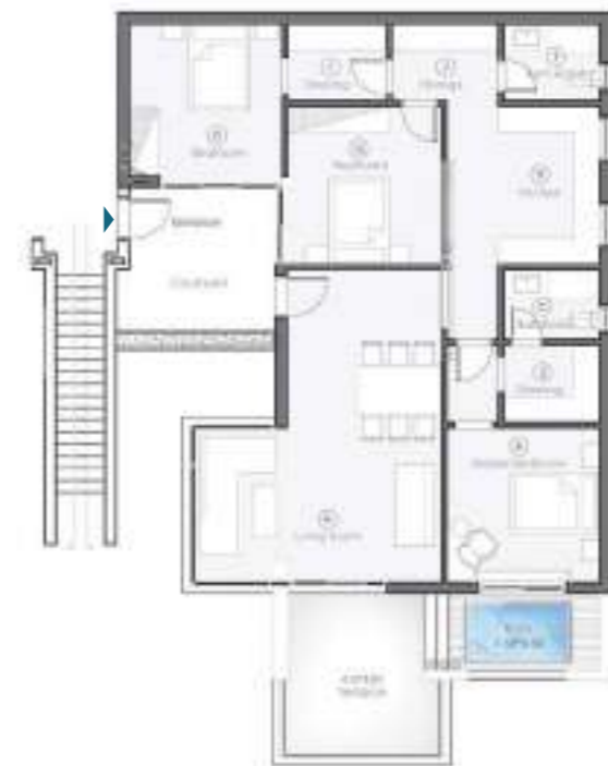
RAINIER CHALET FIRST FLOOR