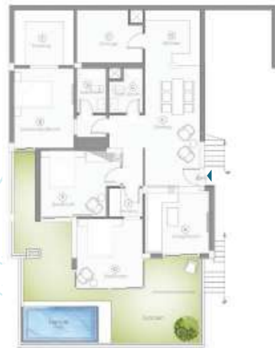
GRAND RIVIERA CHALET GROUND FLOOR