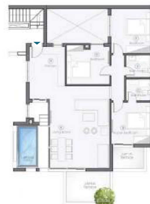
GRIMALDI CHALET SECOND FLOOR