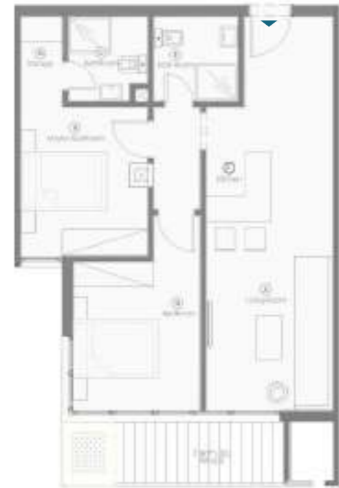
LAKE LODGES TYPICAL FLOOR