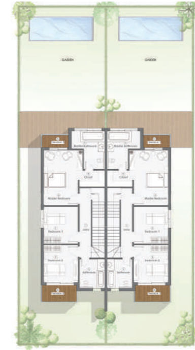
TWIN HOUSE FIRST FLOOR