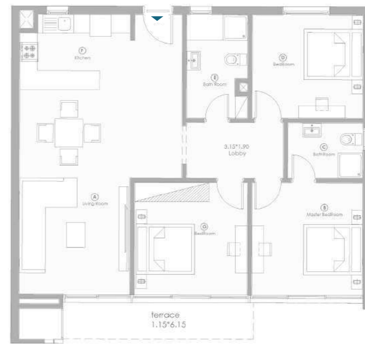
DOUBLE C- 3 BEDROOMS TYPICAL FLOOR