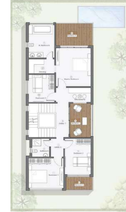
MINI STAND ALONE FIRST FLOOR